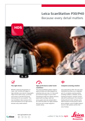
Leica ScanStation P30/P40

Heinrich-Wild-Strasse 9435 Heerbrugg, Switzerland +41 71 727 31 31