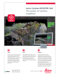
Leica Cyclone REGISTER 360

www.vertical-3d.com contact@vertical-3d.com 07 67 89 20 34