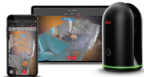
Leica BLK360 3D laser scanner and Leica Cyclone FIELD 360 mobile-device app.

Can be downloaded from Google Play Store and Apple App Store.