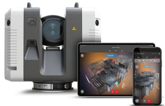
Leica RTC360 3D laser scanner and Leica Cyclone FIELD 360 mobile-device app.