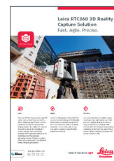
Leica RTC360 Data Sheet