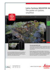
Leica Cyclone REGISTER 360 Data Sheet